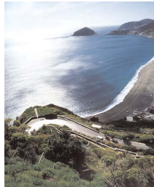
View of Ischia Island